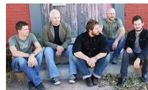
THE NADAS – 9 PM

2:00—4:00 OPEN HOUSE At Hattie Grace Boarding House