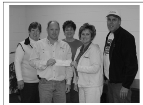
United Bank of Iowa presented a check from their Homecoming Cookout.

Thank you to all the above who have generously given to the Odebolt Arthur Education Foundation. All gifts are greatly appreciated!